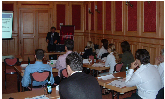
Participants at EPPPC's training in May 2006